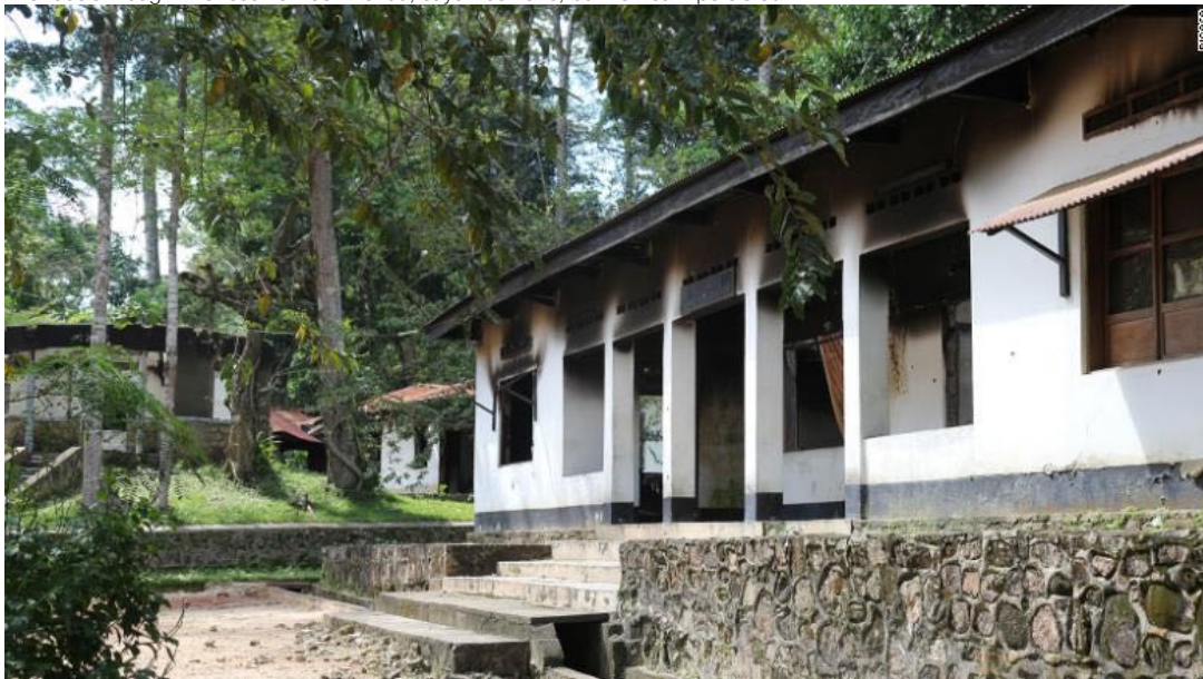
The ICCN headquarters at Epulu looted and burned after 2012 attack.