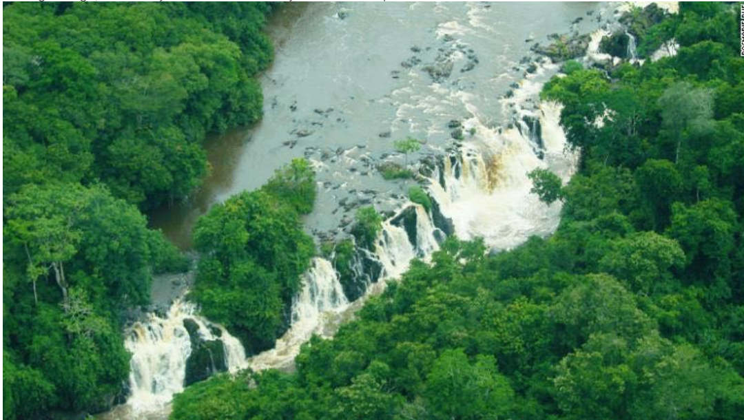
The thundering Arabia Waterfall inside the Okapi Reserve.

incentive to support conservation. Congo also has mountain gorillas in Virunga Park, just south of the Okapi Reserve, but after two British tourists were kidnapped there last year, the region is considered too dangerous for a viable tourism industry. "We get one or two tourists coming through," Lukas says. "I don't know if they're brave or stupid."