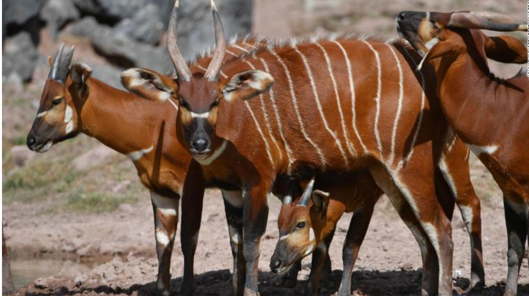
A bongo antelope.

Lukas is determined to hold the line, waiting for an upturn in the Congo's fortunes that has proved to be as elusive as the okapi.