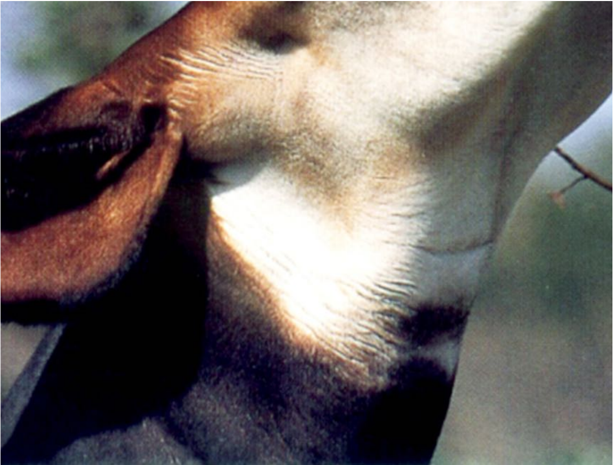
An okapi's tongue can be 18-inches long.