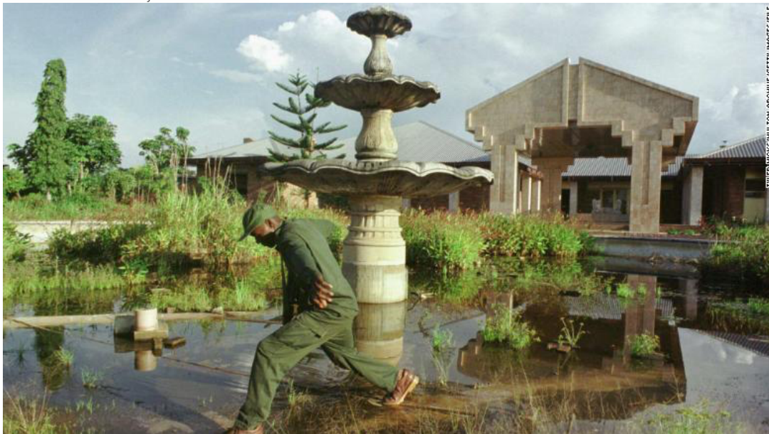
A soldier steps across an overgrown fountain in front of one of the late Mobutu Sesse Seko's palaces September 15, 2000 in Gbadolite, Congo. All three of the elaborate palaces in Gbadolite have long been looted.

After rising to power, Mobutu had renamed the Congo Zaire, cloaked himself in leopard skin and drained the country's coffers, buying off his enemies to maintain stability. His sleepy birth town of Gbadolite in the north, was turned into a lavish city, nickednamed the "Versailles of the Jungle." Replete with Western-style malls, supermarkets and a five-star hotel, it also featured three opulent palaces with Louis XIV furniture, Italian marble and illuminated fountains. In 1985, Gaston Lenôte, then the world's leading pastry chef, was flown in to Gbadolite aboard Concorde with a birthday cake for Mobutu .